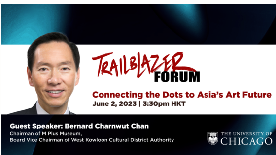
Trailblazer Forum: Connecting the Dots to Asia's Art Future