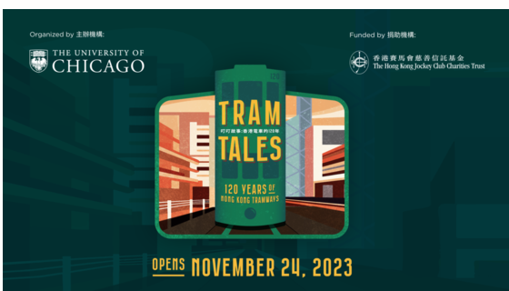
Tram Tales: 120 Years of Hong Kong Tramways