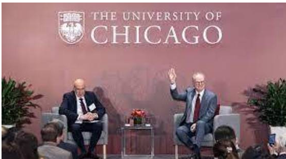
President's Fireside Chat