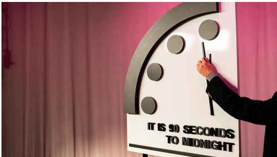
How Close is Humanity to Apocalypse?