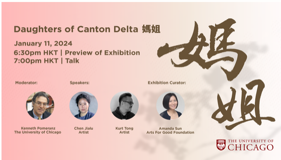
Event Recording: Daughters of Canton Delta