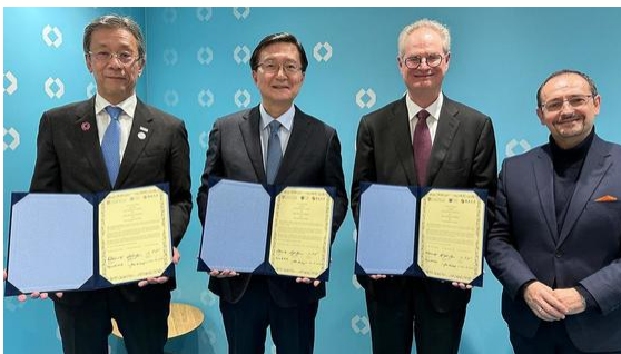
UChicago Signs Partnership at Davos to Promote Quantum Science