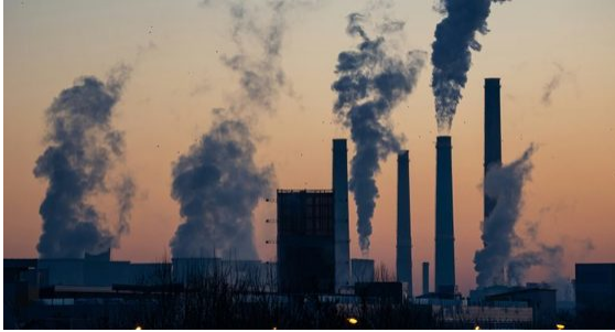
How Combating Air Pollution Can Also Help Create a More Equal World