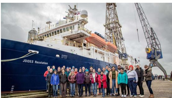
Scientists Seek to Understand Earth’s Past Climates