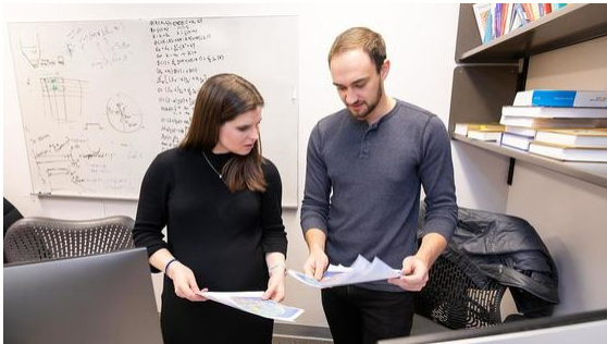
UChicago Scientists Pioneer Technique to Visualize Anti-ferroelectric Materials