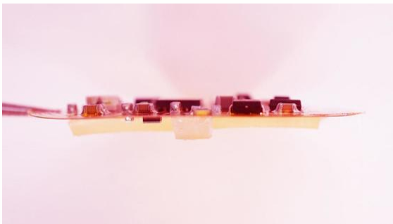
UChicago Scientists Invent “Living Bioelectronics” That Can Sense and Heal Skin